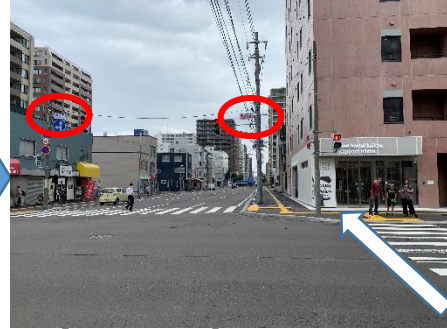
「南2東2」と「南3東2」の交差点 Intersection of "South 2 East 2" and "South 3 East 2"