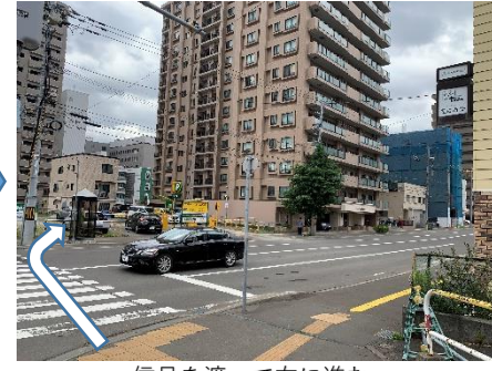
信号を渡って右に進む Cross the traffic light and go to the right.