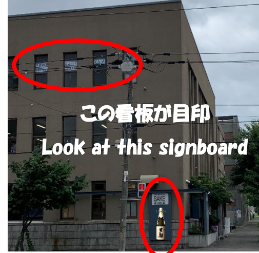
この看板が目印 Look at this signboard