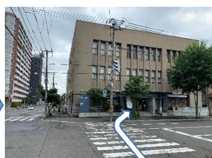
交差点を渡った所が入口です The entrance is across the intersection.