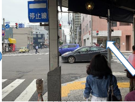
交差点を渡る cross an intersection