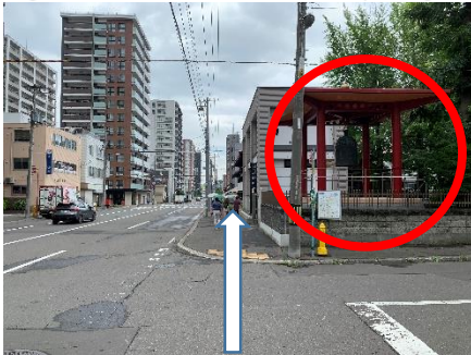
「鐘」を右手に真っすぐ進む Go straight ahead with "Temple Bell" on your right.