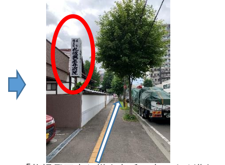
「札幌興正寺」様を左手に真っすぐ進む Go straight with "Kosho-ji Temple" on your left.