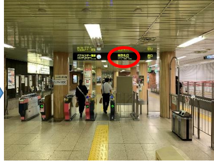
東改札口 East ticket gate