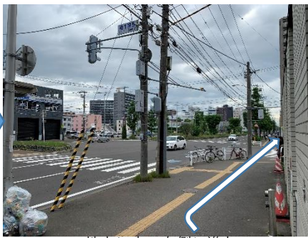
地上に出て右側に進む Exit to the ground and turn right.