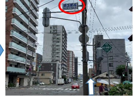
「南3東4」の交差点を渡り真っすぐ進む Cross Intersection of "South 3 East 4" and go straight