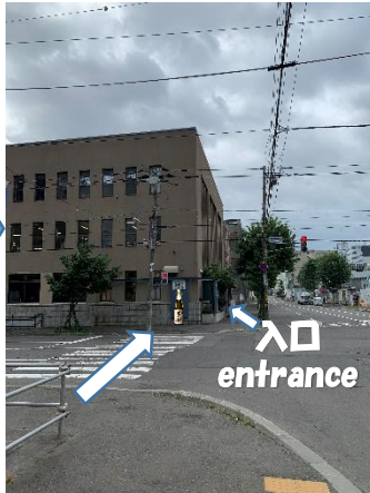
交差点を渡った所が入口です The entrance is across the intersection.