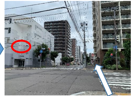
「南2東3」の交差点を渡り真っすぐ進む Cross Intersection of "South 2 East 3" and go straight