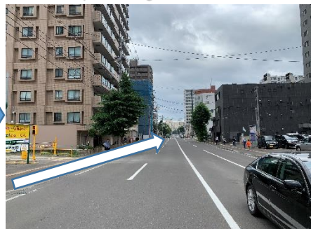
「酒ミュージアム」まで270m 真っすぐです 270m to "Sake Museum" Straight ahead