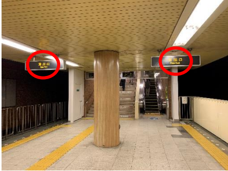
東出口 East Exit

(駅から徒歩約5分 about 5 minutes away on foot from the station)