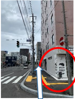
「BEER & BOWL」様を右手に真っすぐ進む Go straight ahead with "BEER & BOWL" on your right