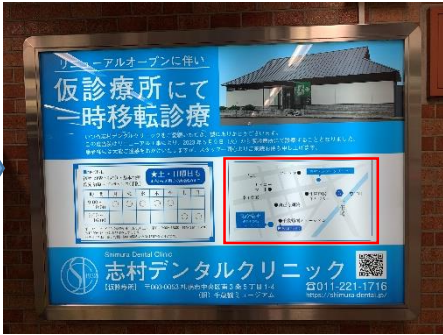
志村デンタルクリニック様の看板に地図 There is a map on the sign of Shimura Dental Clinic.