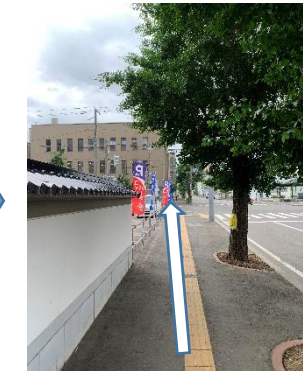
「札幌興正寺」様の先の建物が酒ミュージアム The Sake Museum is past "Kosho-ji Temple".