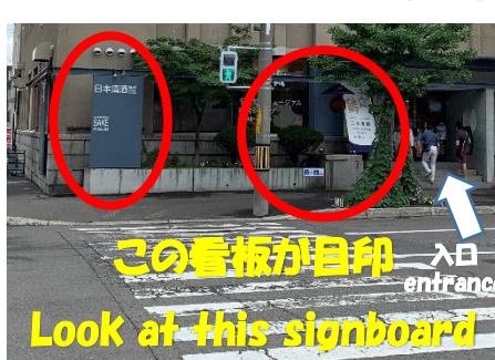
この看板が目印 入口 Look at this signboard entrance