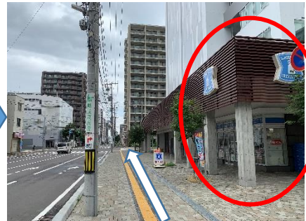
「ローソン」様を右手に真っすぐ進む Go straight with "Lawson" on your right hand side.