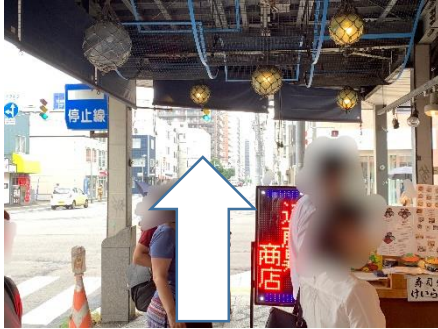
「二条市場」を右手に真っすぐ進む Go straight ahead with "Nijo Market" on your right