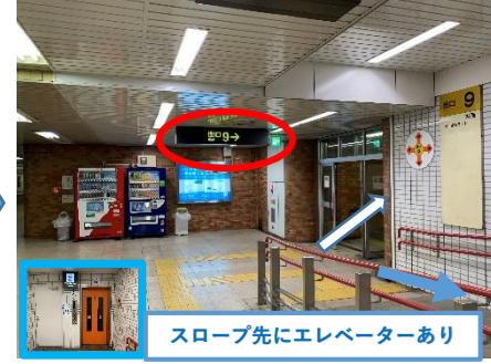
出口9番階段 Go up the stairs at Exit 9