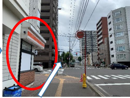
「セイコーマート」様の交差点を渡り真っすぐ進む Cross the intersection of "Seicomart" and go straight